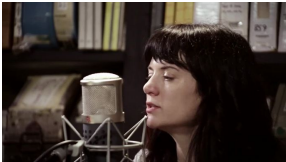
Nikki Lane - Highway Queen